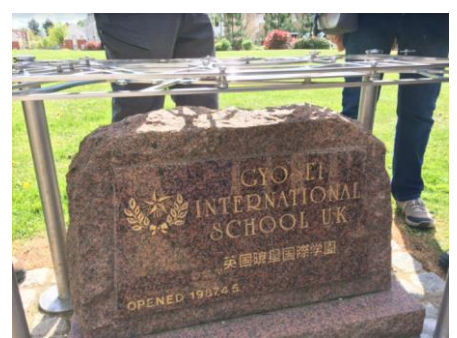
A selection of photos from the Gyosei Art Trail