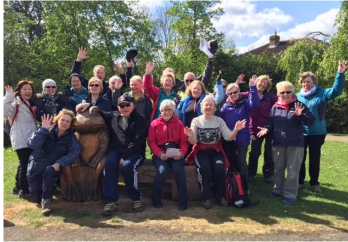
Members of the Summer Redway Walking Group