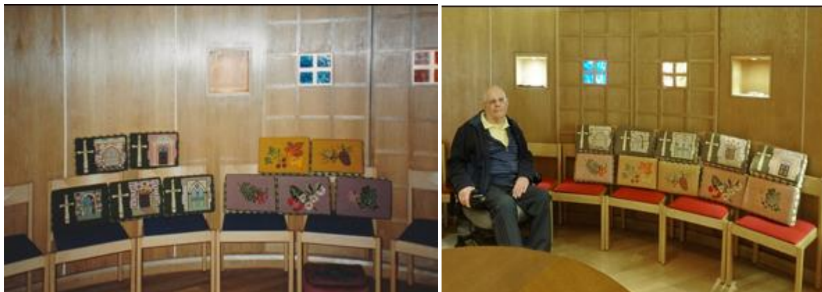
Still looking good after twenty-three years of use!

In May 2017. Following a meeting with the archivist to the Church of Christ the Cornerstone; a visit to the Chapel was made & photographs taken of the kneelers.