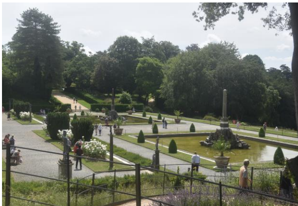
The Water Terrace