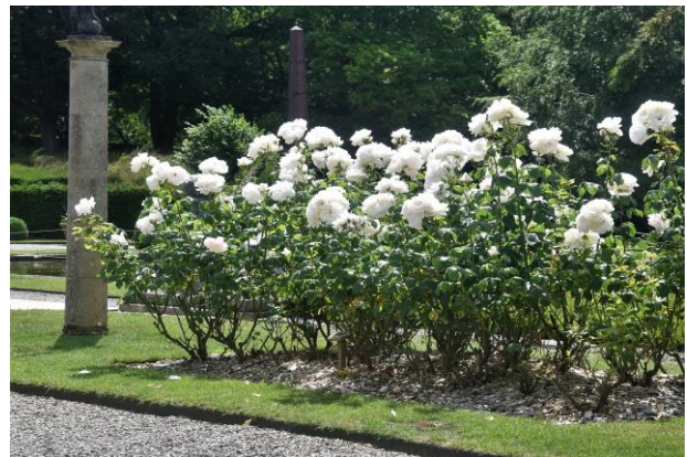
The Rose Garden