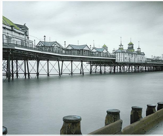
Eastbourne Pier Before the Fire

Sign up in the diary section of the MKu3a web site.