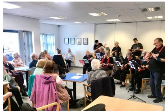
Entertaining Bucks Vision at Age UK

We have a few more gigs in the calendar over the coming months. Although we do not have vacancies at present, we will be reviewing our numbers at the anniversary of our move to the Synagogue in June/July. We still have a waiting list for when we can take on new budding strummers.