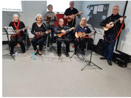
Baden Powell Guild AGM