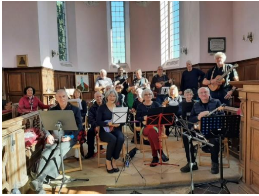
Willen Church at a Tuesday Concert