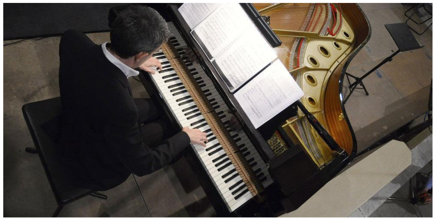
the boring kind" ... We promise you will not be bored!

Tickets: £20 - £15 - £10 (£5 for under18s) on the door, or book via our Box Office telephone 01908 583460.