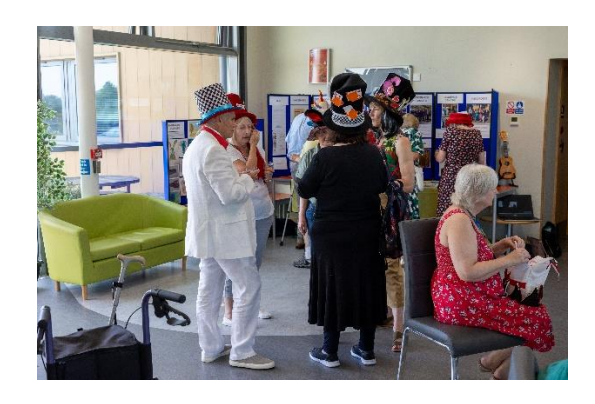
Group Information and Displays