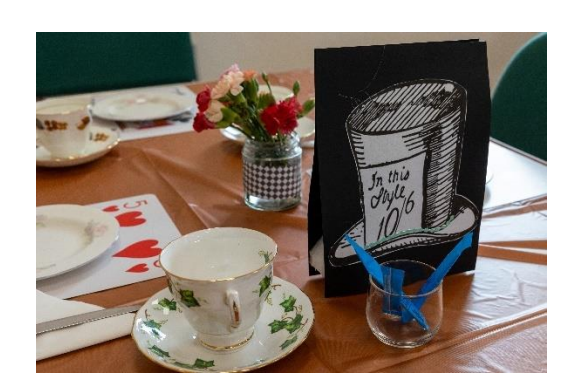
Welcome Drink, Chatting and Viewing Group Displays