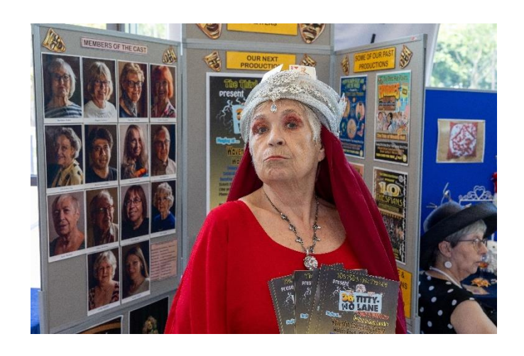
The Third Age Player Display from the Mad Hatters Tea Party